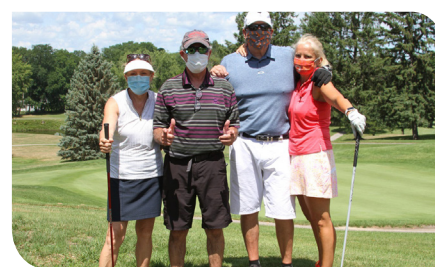
Pictured above are (left to right): the first place winners, the second place winners, and the 'Generations' team.