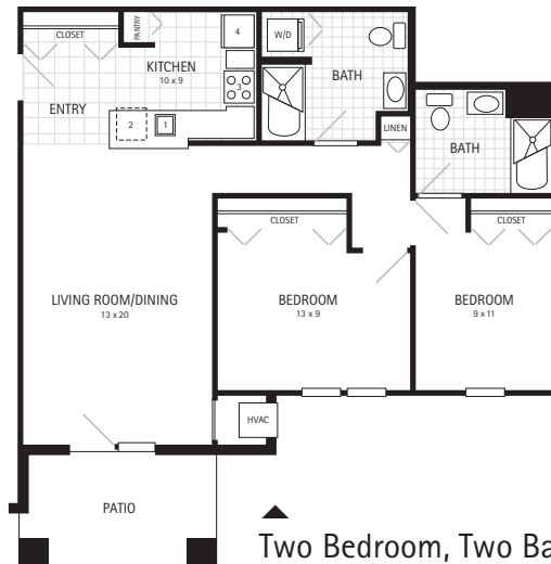
Two Bedroom, Two Bath 910 Square Feet