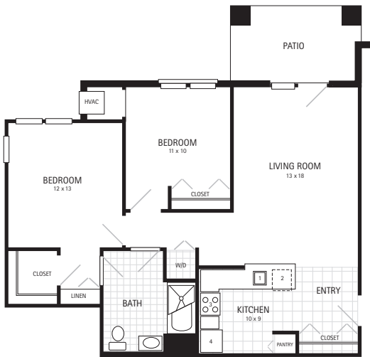
Two Bedroom, One Bath 880 Square Feet