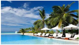
4 Days/3 Nights Premium Hotel Package plus $400 toward airfare

All proceeds benefit the elders of St. John's.