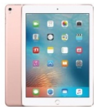
9.7-Inch iPad Pro™ Wi-Fi® 32GB