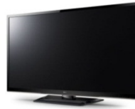
LG 48" LED HDTV